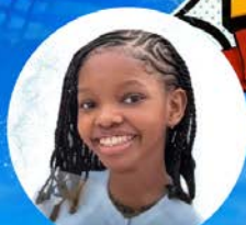
Princess Amelia George Allegheny East Conference