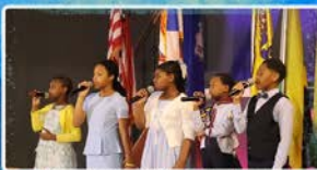
Shalom SDA Children's Praise Team